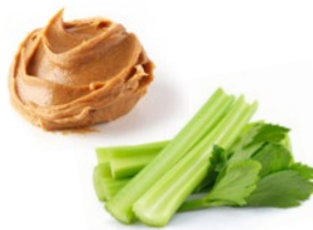
Celery with peanut butter