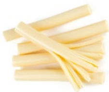
String cheese stick