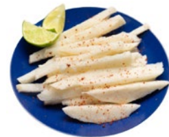
Jicama tossed with chili powder and lime juice